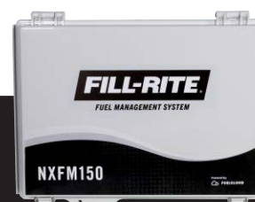
NXFM150 5 Hose Expansion Module