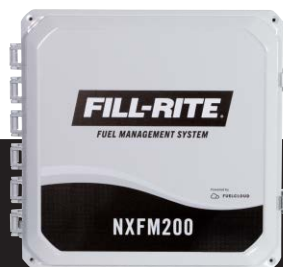
NXF200 Site Controller

Access information from anywhere at any time. With our subscription-based service, updates and improvements happen automatically on a regular basis and you never have to pay extra for them.